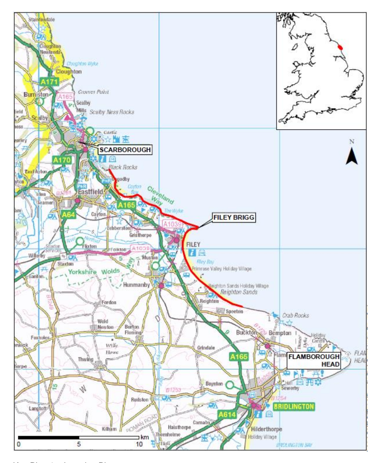
Key Plan 1 – Location Plan