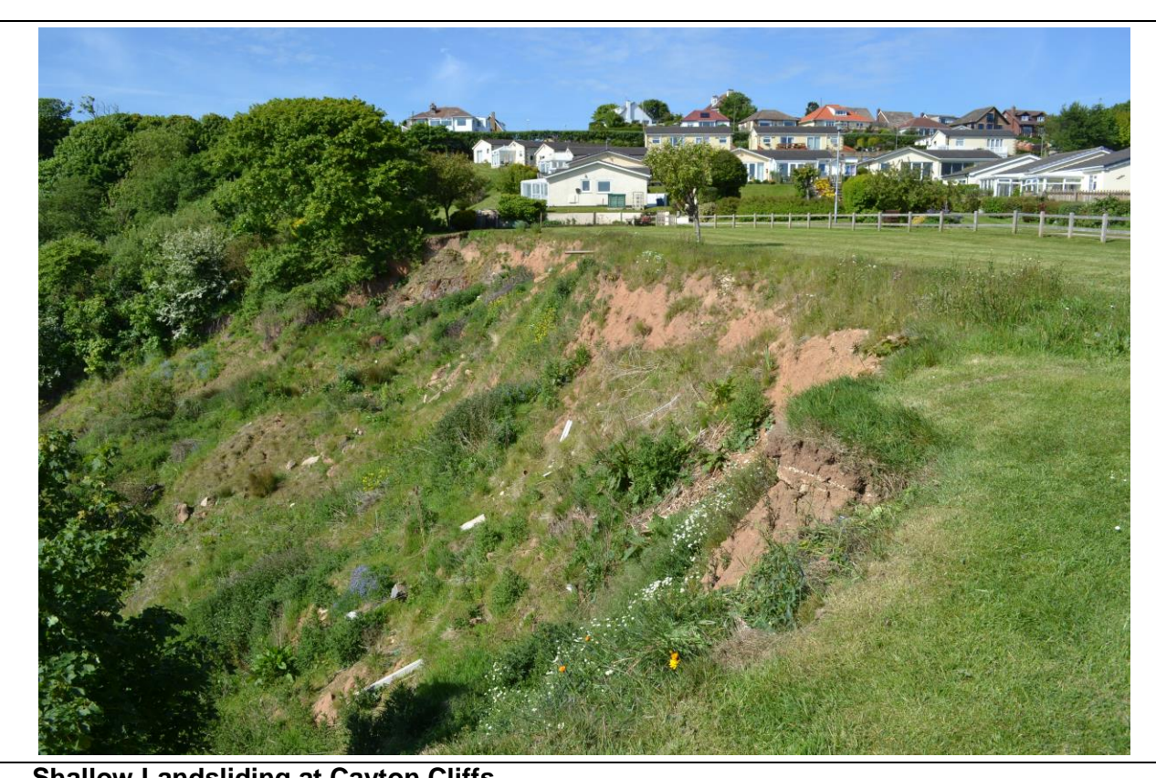
Shallow Landsliding at Cayton Cliffs

Filey and Cayton Bay Coastal Strategy (White Nab to Speeton)